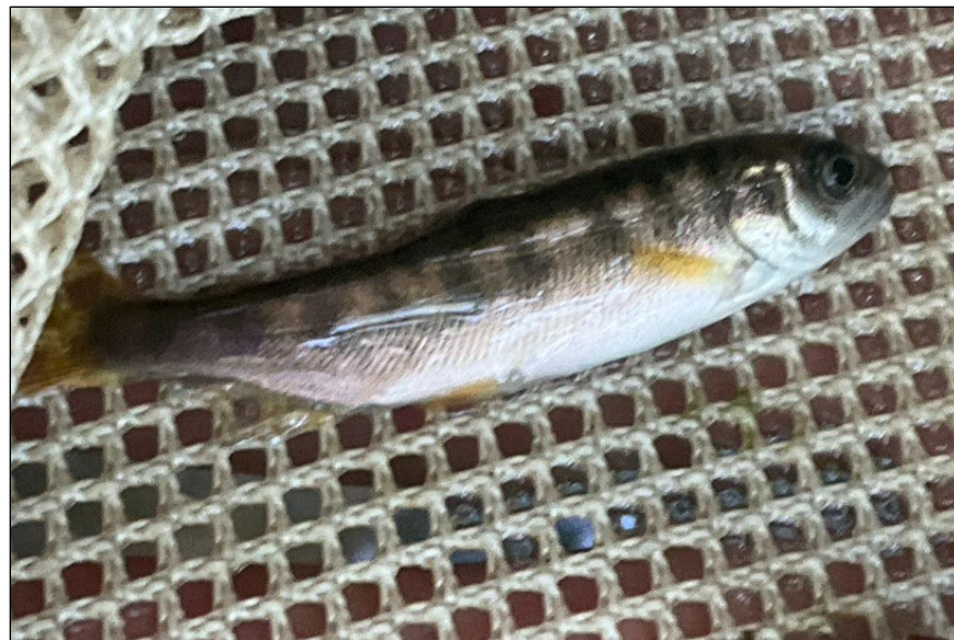
Figure 1.–Coho salmon caught at waypoint 1136.