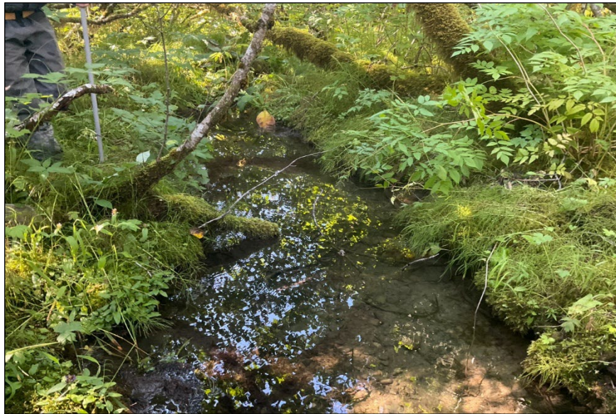
Figure 3.—Looking downstream at waypoint 1136.