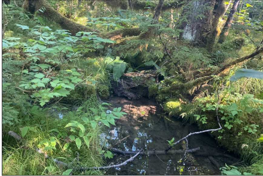
Figure 2.—Looking upstream at waypoint 1136.